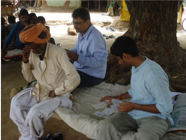
Figure 2: Testing prompts in the field using paper flashcards read to the user from behind.

them with farmers that already felt comfortable with the technology. This served as a sanity check that the application could be used under the best possible task/user scenarios.