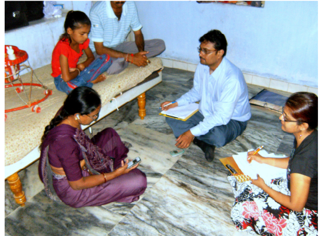
Figure 3: Evaluating Avaaj Otalo with a farmer in her village home. The user is testing the DTMF version of the interface.

compare performance and user preference between the two modalities. We found that DTMF dominates in terms of performance and learnability, and that users found they had much less difficulty providing input using DTMF. This result is useful for practitioners who are choosing between input alternatives, where high-capability ASR technology may be costly in terms of time, effort, and resources.